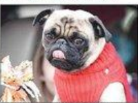
Frankie the dog waits for a treat in Cook.