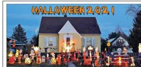
This spooky spectacular on Eighth Street in Ely is a must-see every Halloween.