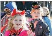
Northeast Range students held a Halloween parade last Friday afternoon.